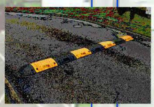
RUBBER SPEED HUMP / JUDDER BAR