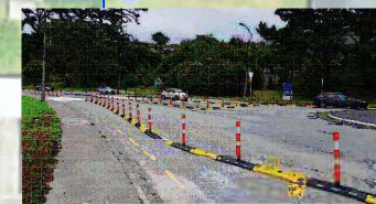
NARROW CARRIAGEWAY USING FLEXIBLE TRAFFIC SEPARATORS (VANGUARD NZ PRODUCT OR SIMILAR APPROVED)