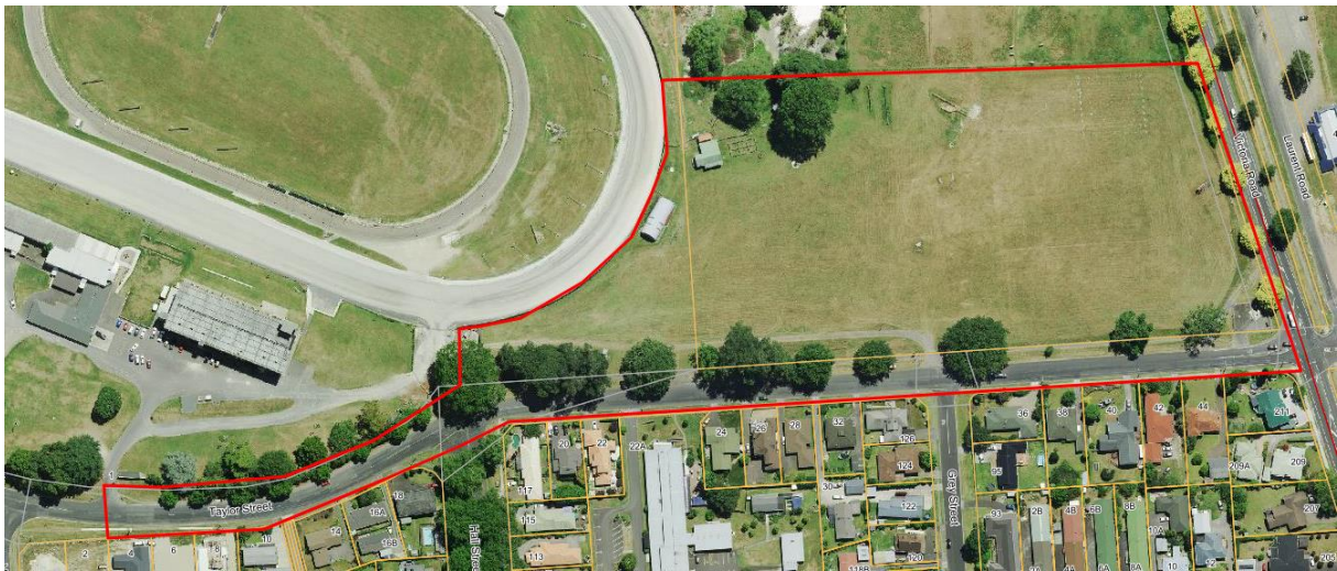
Figure 1: Map of temporary liquor ban area for the Night of Champions at Cambridge Raceway outlined by red line.

Temporary Liquor Ban Map –Night of Champions 2025.