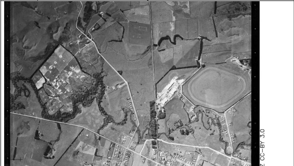
1944 – Industrial activity is apparent adjacent to the site