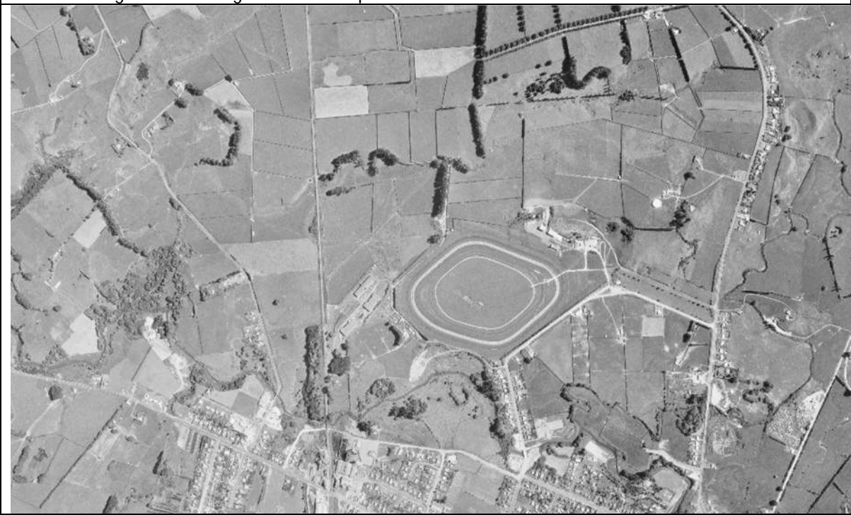
1966 – Similar to 1957 but evidence of earthworks on southern end of site.