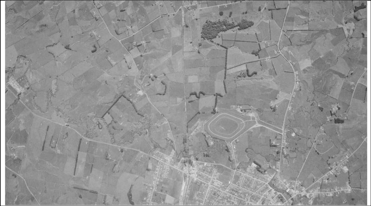
1957 – No significant changes from 1944 photo