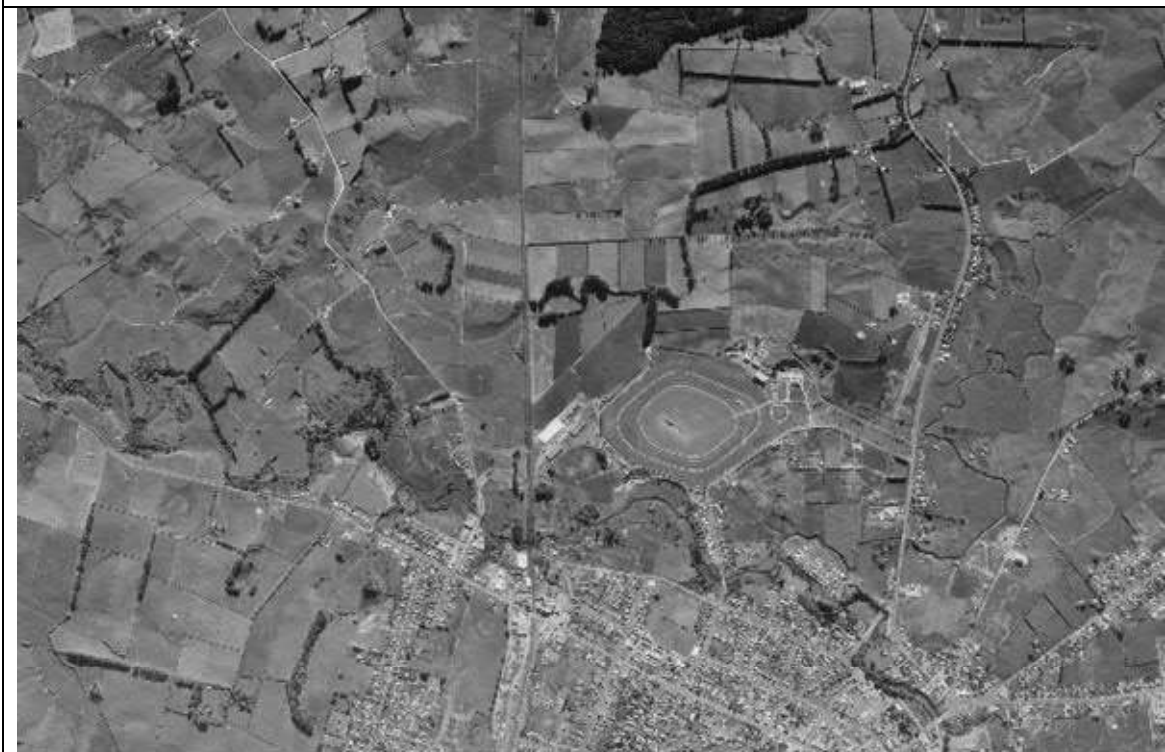
1974 – No significant changes from 1971 photo