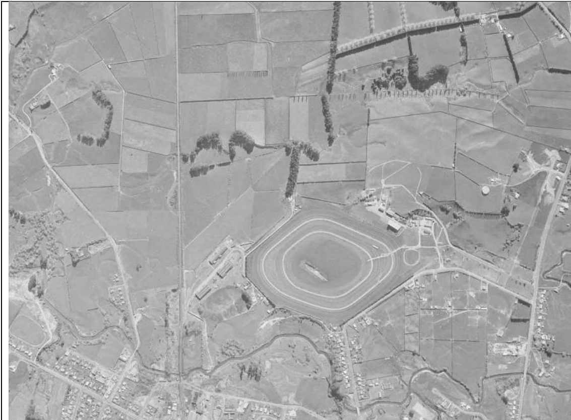
1971 – Additional buildings present south of the industrial complex. No other significant changes from 1966.