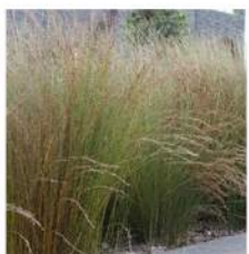
APODASMIA SIMILIS 'CIOI' (ASI)