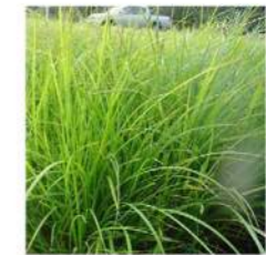
CAREX GEMINATA 'RAUTAHĪ' (CGE)