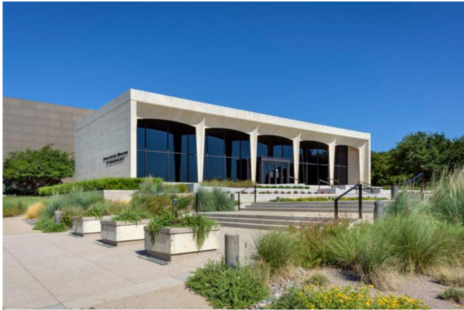
VISITOR CENTRE LANDSCAPING