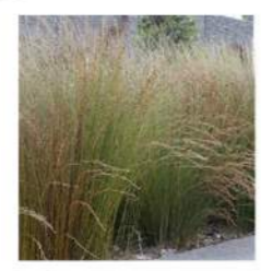
APODASMIA SIMILIS 'OIOI' (ASI)