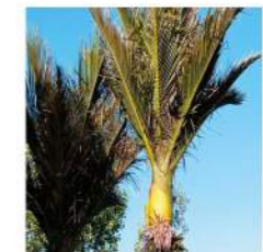
Rhopalostylis sapida 'Nikau palm' (RHOSAP)