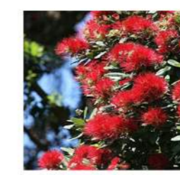
pōhutukawa (M. excelsa)