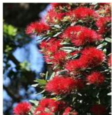
pōhutukawa (M. excelsa)