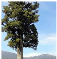
DACRYDIFORMIS DACRYDIODES 'KAHIKATEA' (DDA)