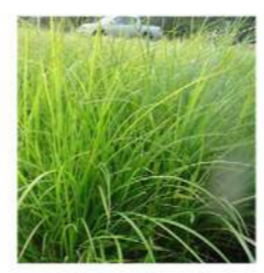
CAREX GEMINATA 'RAUTAHII' (CGE)