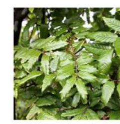
ALECTRYON EXCELSUS 'TITOKI' (AEX)