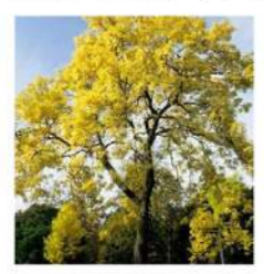
FRAXINUS EXCELSIOR 'ASH' (FEX)