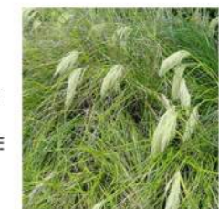
AUSTRODERIA FULVIDA 'TOETOE' (CAR)