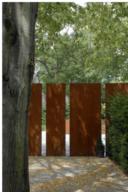
CORTEN STEEL FENCE