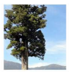
DACRYDIFORMIS DACRYDIODES 'KAHIKATEA' (DDA)