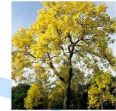
FRAXINUS EXCELSIOR 'ASH' (FEX)