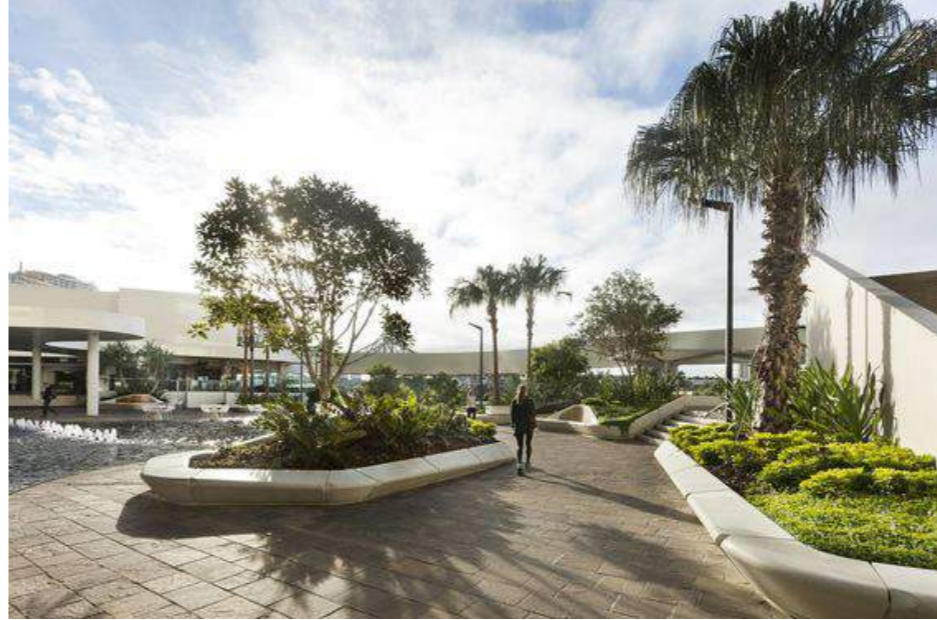
VISITOR CENTRE LANDSCAPING