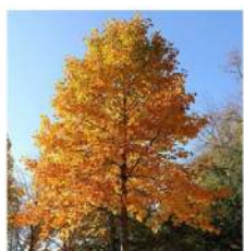
LIRIODENDRON TULIPIFERA 'TULIP' (LTU)