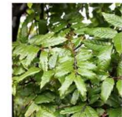
ALECTRYON EXCELSUS 'TITOKI' (AEX)