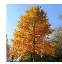
LIRIODENDRON TULIPIFERA 'TULIP' (LTU)