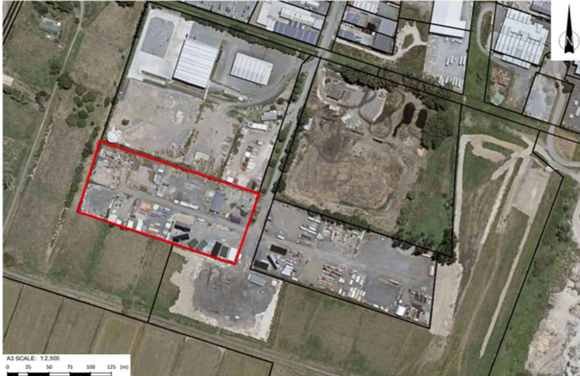
Figure One: Location of Site

The location of the site is 16A Wickham Street, Hamilton. The site is surrounded by highly modified rural and industrial land. The site is located within the Rural Zone under the Waipā District Plan. Neighbouring properties to the north are within the Hamilton City District and zoned for industrial land uses. The closest residential area is the General Residential Zone of Hamilton City approximately 250 m to the northeast of the site. The site and neighbouring lots are not located in any identified flood hazard areas by WRC or under the Waipā District Plan.